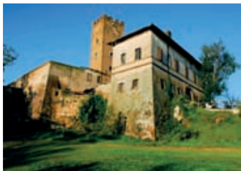
Rome, the “Cervelletta” Manor as it appears today