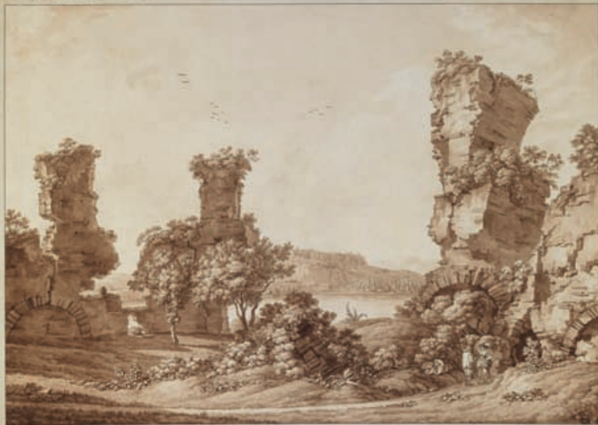
2. Vue de la ville de Nîmes en France, par le Pape.