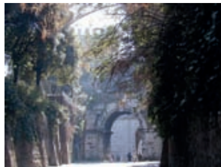
Rome, the Arch of Druso, today