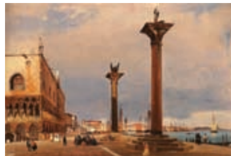
Ippolito Caffi, Venice, Docks and the Riva degli Schiavoni , oil on cardboard on canvas, cm 30 x 44, Ca' Pesaro, Galleria d'Arte Moderna, Venice, inv. n. 1777.