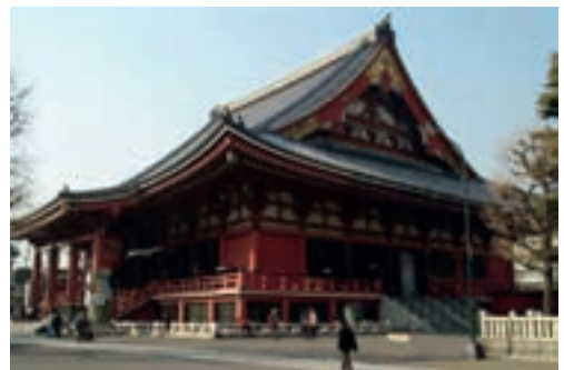
The Central Room of the Senso-Ji Temple in Tokyo, today

Painted during the second half of the nineteenth century, when Japan's extraordinary culture was sparking European interest precisely for its differences from Western artistic tradition, this work constitutes a precious historical document of one of Japan's greatest monuments and symbols.